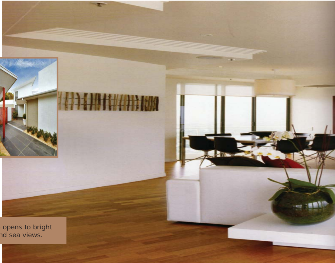
This contemporary home opens to bright sunlight, salty breezes and sea views.